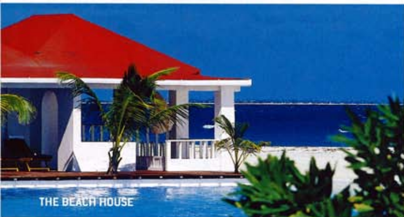
THE BEACH HOUSE